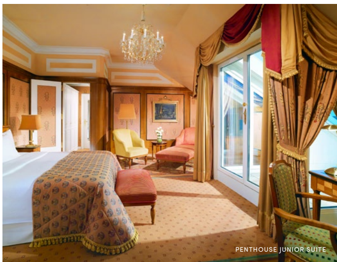
PENTHOUSE JUNIOR SUITE