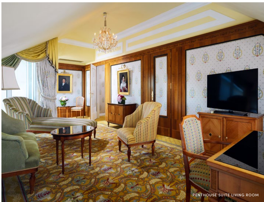
PENTHOUSE SUITE LIVING ROOM

HOTEL BRISTOL A LUXURY COLLECTION HOTEL KÄRNTNER RING 1, 1010 VIENNA, AUSTRIA T +43 1 515 160 — F +43 1 515 16 550